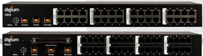
Digium R850 (top photo) and R800